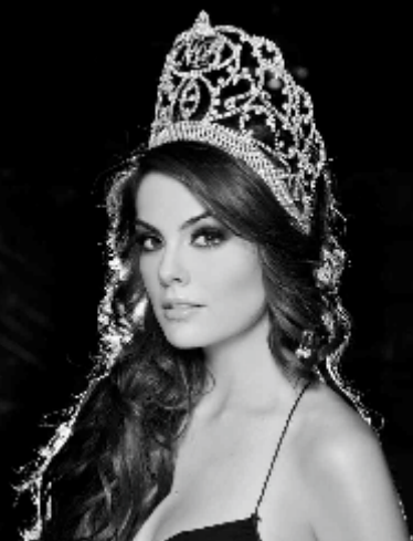
Ximena Navarrete Miss Universe 2010

Jimena "Ximena" Navarrete Rosete is a Mexican actress, TV host, model and beauty queen who won Miss Universe 2010. She was previously named as Nuestra Belleza México 2009. She is the second Miss Universe from Mexico.